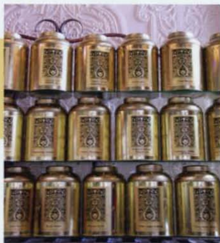
A wide selection at Dushanbe Tea House.