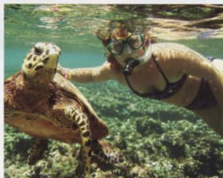
Swimming with a native in Seychelles.

Sailing Association (ASA) certified schools in Colorado that offer the opportunity to become a competent sailor in a short period of time. Locally, Cherry Creek Marina and Sandcastles Sailing offer beginning to advanced ASA classes. As a beginner sailor, Basic Keelboat is the first class to take to gain basic skills such