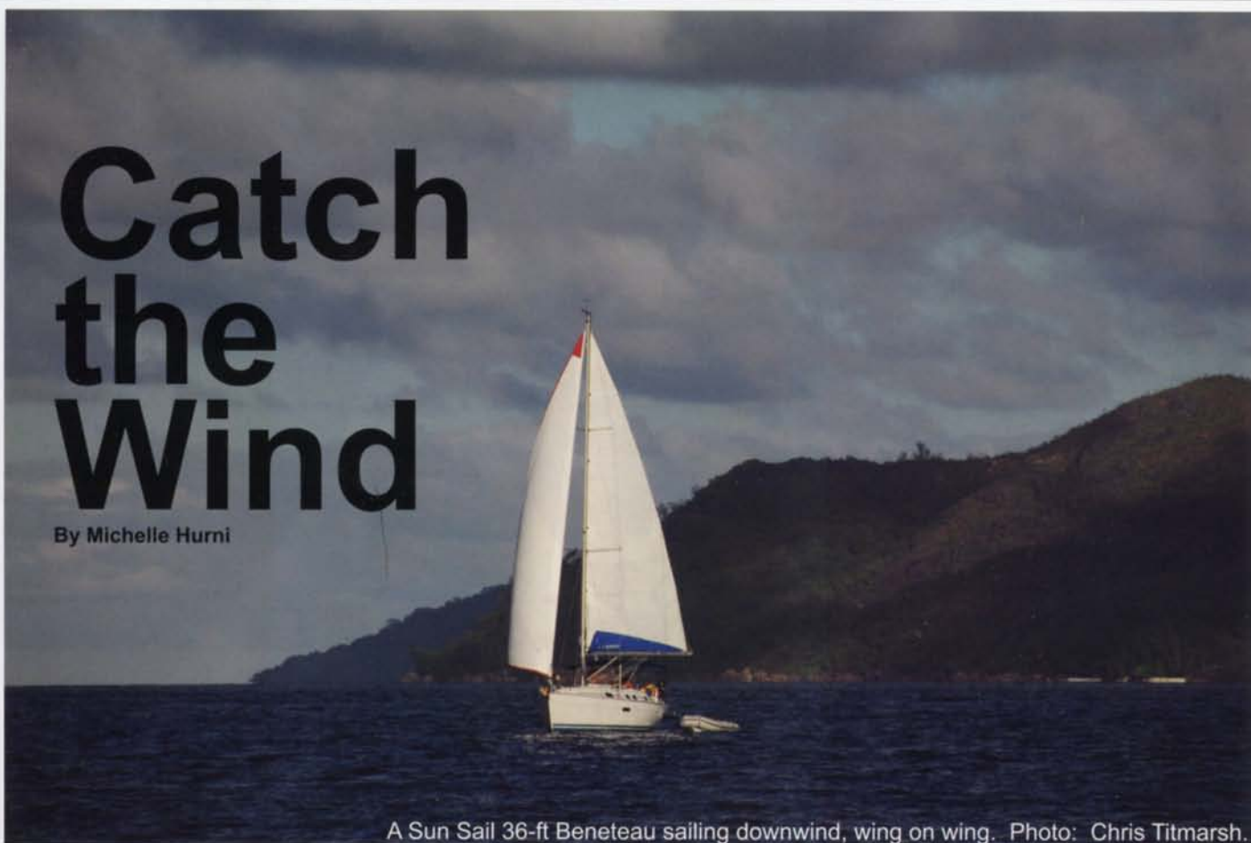
A Sun Sail 36-ft Beneteau sailing downwind, wing on wing.

Just picture the wind blowing through your hair, the only sound the wind filling the sail as you sit on the deck of a sleek sailboat cutting through the deep blue water like butter.