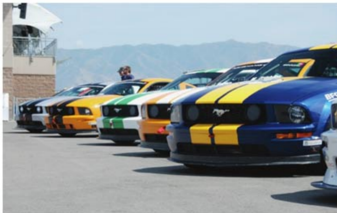
2006 Mustang GTs lined up and ready for the final at the Ford Racing High Performance Driving School.