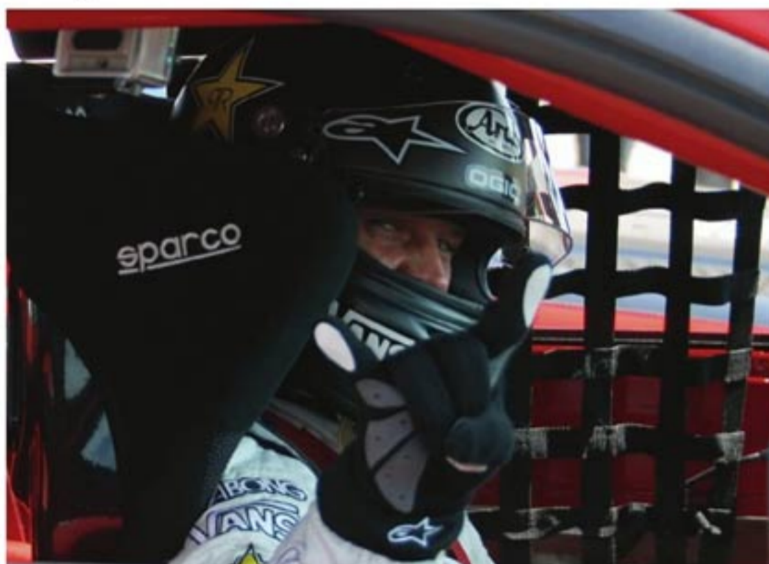
It's not time to get serious...Yet.