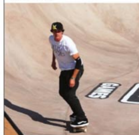
Cruising the Park course flat bottom during Park Elimination in X Games 15, held in 2009.

(Bucky Lasek is a Baltimore, Maryland native who lives in Southern California with his wife and three daughters.)